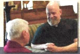
Supporting the needs of our senior priests in the Diocese of Rockville Centre.

“There can be no Eucharist without the priesthood, just as there can be no priesthood without the Eucharist.” - Pope St. John Paul II